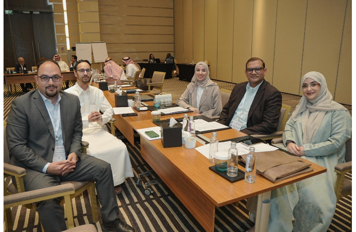
Photo: Masterclass on SDGs & Green Building by SGBF-UNITAR with inputs from UNIDO and University College Dublin